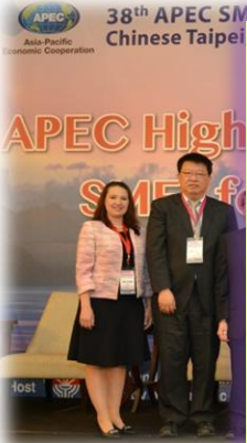
APEC High Level Meeting SMEWG Chinese Taipei

We, the senior APEC family, Dialogue on Resilient Small and Medium Enterprises Working Group